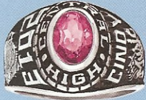
C41 GLORY Customize up to 10 characters per side