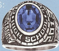
C31 CENTENNIAL Customize up to 12 characters per side